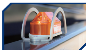
Acousto-optic Warning Lights