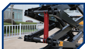
Safety Overhaul Bracket