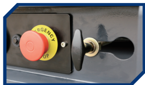
Emergency Lowering System